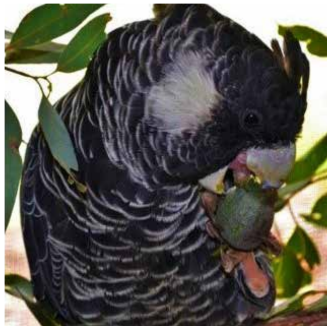
Photo | Carnaby white-tailed black cockatoo extracting Marri seeds from a honky nut

Retrace your steps back to Forrest Road, turn right and follow the footpath to cross at the level rail crossing. Continue along the footpath as it turns right into Commerce Ave where you will pass the RSL Hall (1935), and its WWI water cart, Furphy (1915). Continue walking south along Commerce Ave, enjoying the Spotted Gums (Tree 6) that were planted to replace an avenue of Sugar Gums that were planted here over a century ago.