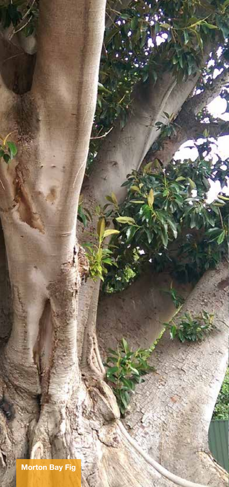
Morton Bay Fig

Proceed south along Railway Ave passing under the heavily-pruned Queensland Box trees (Tree 14) and turn right when you reach Forrest Road. As you reach the roundabout, turn left into Green Ave, continuing to the driveway of the Armadale Fire Station (original 1963, current 1993).