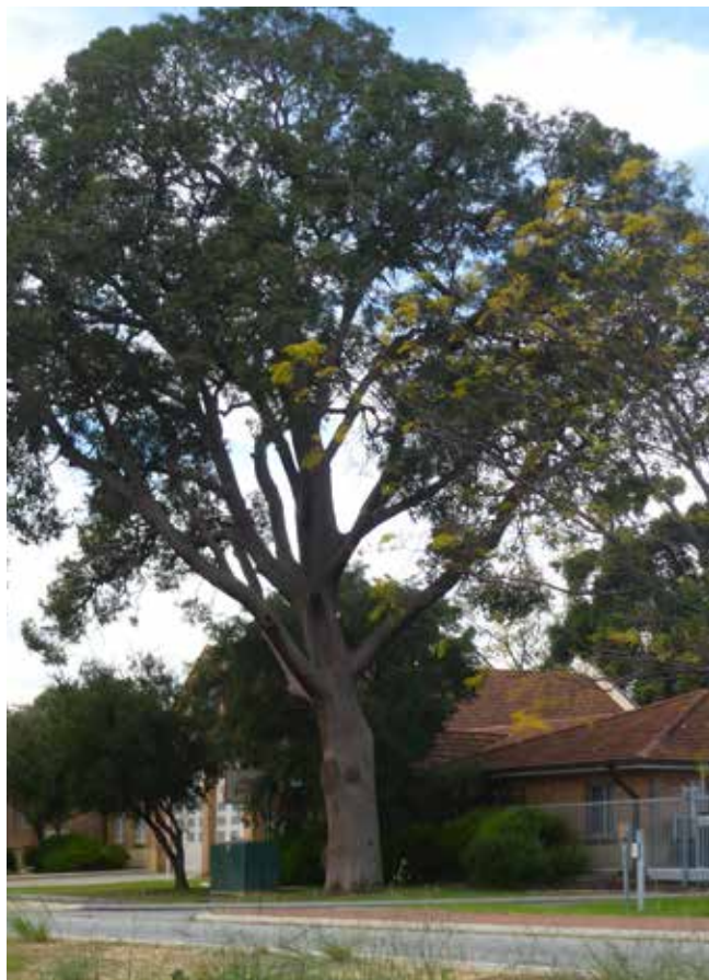
Tree 19 | Marri.

One of the few examples left in central Armadale of this region's most characteristic native tree. Marris are part of a group of eucalypts known as bloodwoods, recognised by the red sap, kino, they sporadically exude. The kino is not a sign of damage to the tree, and has antiseptic properties discovered and widely used by Noongar people. Able to grow to 40m, this Marri is beautifully-formed, with a dense, dark-leaved, spreading canopy, and distinctive fruit – honky nuts – a favourite food of several colourful parrots, and the endangered black cockatoos.