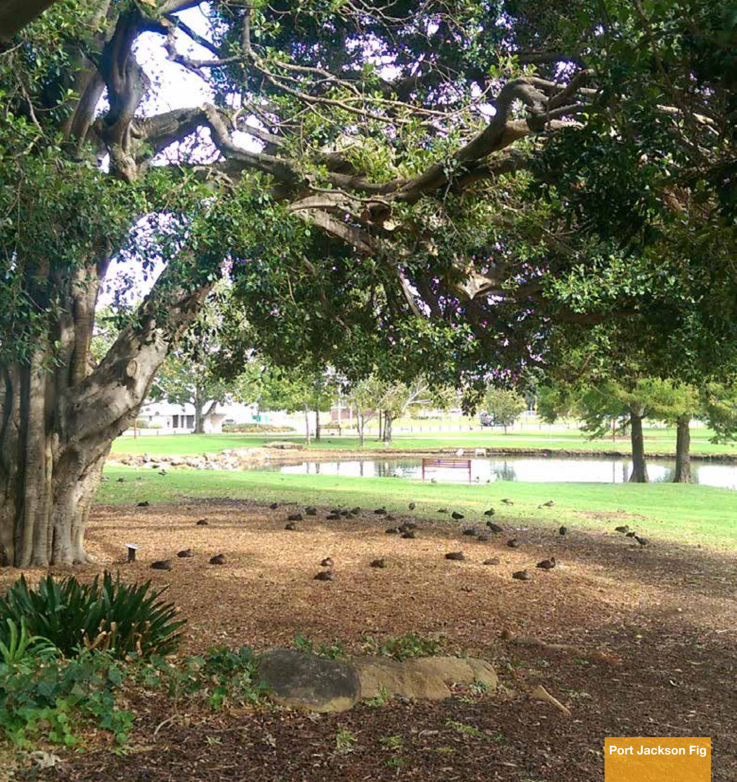
Port Jackson Fig