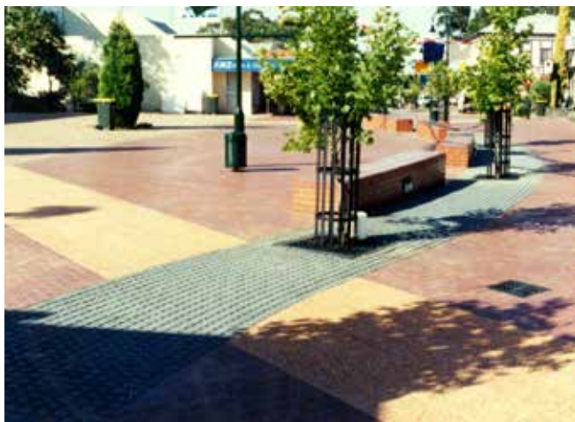
Tree 20 | Young London Plane trees, 1992

These deciduous trees were chosen to beautify the commercial space, and were planted by councillors of the City to commemorate the mall's opening in 1992. Their deciduous habit provides much-needed shade in summer and light in winter.