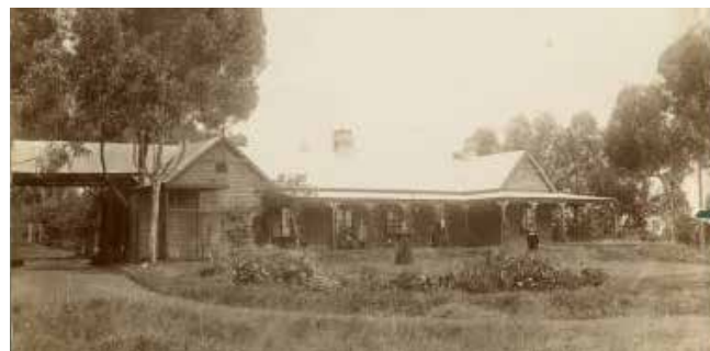
Historic photo 5 | Sugar Gums at the Jull homestead, Brookside, c.1905