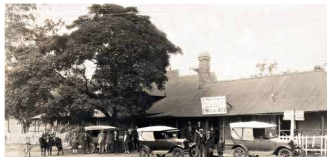
Historic photo 4 | The Narrogin Inn, cnr Albany & South West Highways, 1927