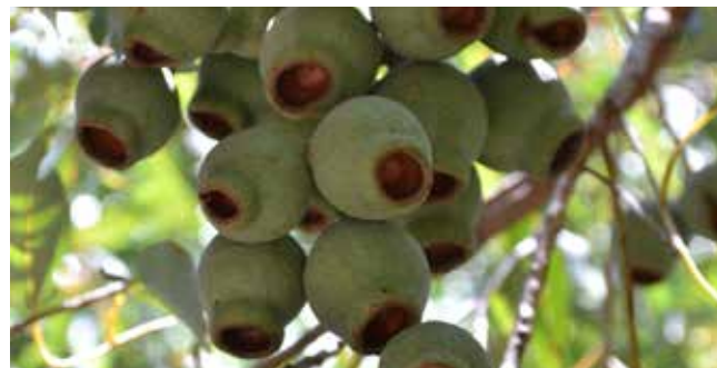
Tree 19 | Marri fruit, commonly known as honky nuts