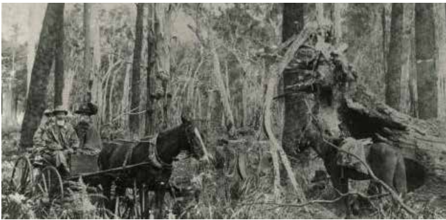
Historic photo 10 | Saw Family felling timber, c.1860

The attractive cream trunk of the Wandoo is characteristic of this medium-sized native, which can reach heights of 25m. Known scientifically by its Noongar name, its growth in this area is restricted to the western face of the Darling Range, and the outwash plains immediately below, where it grows in close association with red clayish soils derived from diorite rock. A beautiful and extremely hard wood, forests of Wandoo are found further east as a source of sawn timber since the late 1800s.