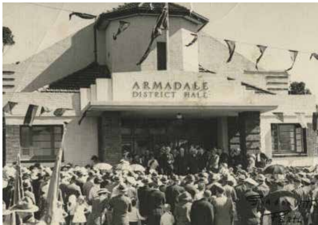
Historic photo 1 | Opening of the Armadale District Hall in 1936

Exiting the Visitors' Centre, turn left and walk along Jull St until you reach the Armadale District Hall (1936), included on the State Heritage Register as an example of Art Deco style. On either side of the entrance there are two beautiful native frangipanis that are at their best when flowering around October.