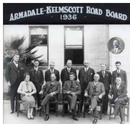
Historic photo 6 | One of the Fan Palms outside the Road Board building, 1936 Opposite. Tree 11 | Fan palm at Armadale-Kelmscott Road Board building, 2015