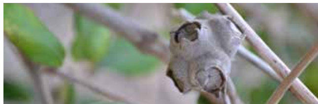
Tree 25 | The unique, fused Turpentine nuts, 2016

Indigenous to wet coastal forests of Queensland and NSW, the odour of the crushed leaves and flowers give the tree its common name. Flowering in late spring, the fruits of this tree are its most recognisable feature - seven are fused into one woody structure. An excellent timber tree, this specimen was probably planted here by the O'Reilly family who had a property here in the 1940s.