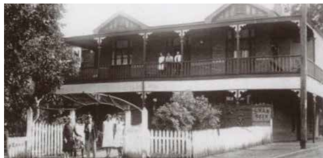
Historic photo 7 | The Railway Hotel, Armadale, c.1920

Turning around, cross over at the traffic lights to the Armadale Train Station, originally a siding (1893) and then a substantial station and platform a few years later. Continue walking south, and when you reach the intersection of Fourth Rd, you will be under the spreading branches of a younger specimen of Sugar Gum.