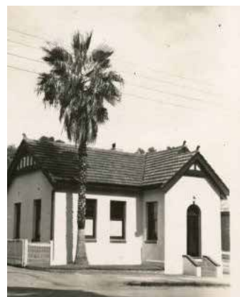
Tree 11 | Fan palm at Armadale-Kelmscott Road Board building

Rarely seen reaching this height, these two very elegant specimens were planted in the 1920s. They are native to the drier parts of California, where they grow in canyons and ravines under almost desert-like conditions. As a result of the palms' placement at the Road Board building, their growth can be followed in the many photos taken over subsequent years.